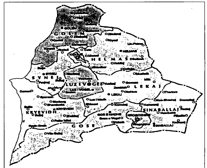
Map of Kavaja District

in teams of two with their team driver by going into the communities of Kavaja and inviting people to participate in Civic Forum Albania to gain more knowledge about their government, their rights and their responsibilities in improving their communities. Each team will be working with 20 different citizen groups throughout the district of Kavaja to guide them into being more active in their communities.