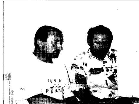
Citizens of Civic Forum in Manëz working in their economic development office.

The cases mentioned show the importance of these trainings because the citizens see by their own eyes positive experiences of other communities in different countries. So when they come back, they will be more willing and more engaged to solve issues in their communities.