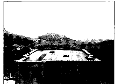
A view of the rehabilitated roof by the Civic Forum group in Petrela