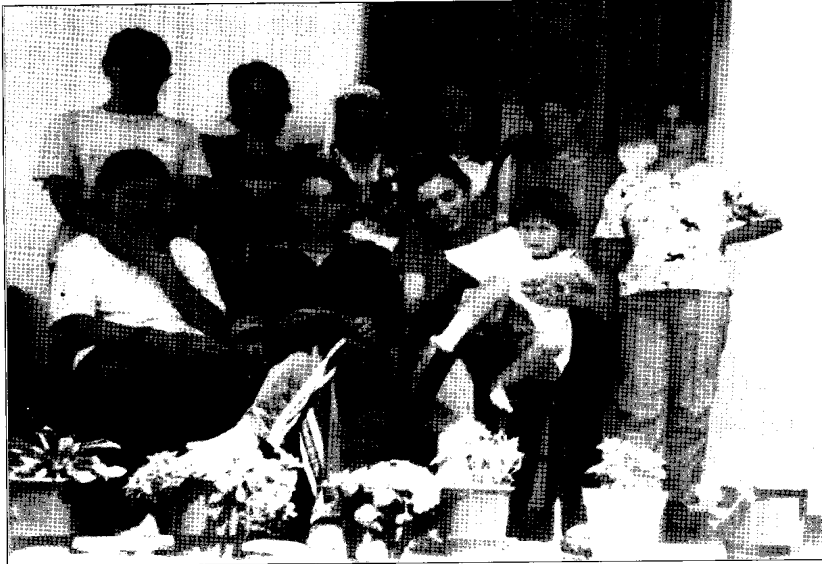
Woman's group in Fushas/Baldushk

After a year of work with Civic Forum, the citizens in Fushas took concrete actions to solve some of their community issues. The discussion group in the village of Fushas is in the commune of Baldushk, of Tirana city. Young women and girls who have few possibilities to go out of the village compose this group. In the beginning, they had no knowledge about democratic government and needed to develop skills to be active members of the community, but now they are informed and ready to solve problems.