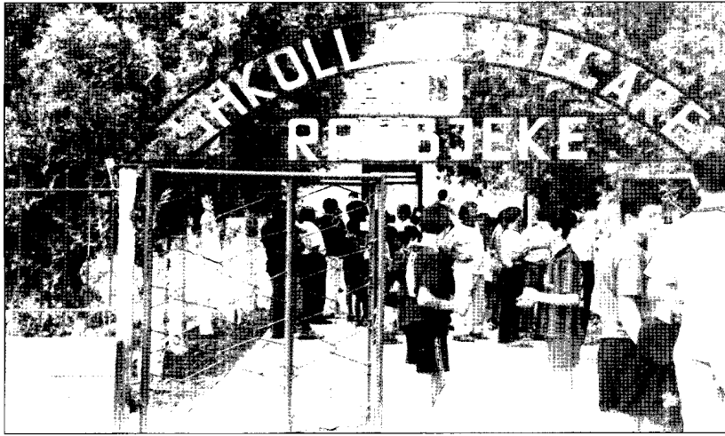
The school in Rrubjeka rehabilitated by the Civic Forum citizens

In April a group of Civic Forum citizens from different areas of Tirana and Durrës traveled to Bulgaria to participate in a community organizing training organized and funded by World Learning. The group participated in theoretical training such as: how to compile projects and proposals and developing communication skills. The citizens received additional knowledge that will help them as community organizers. In meetings with the local government of villages of Bulgaria, the participants in the training learned about methods which are used to make their work more transparent in the eyes of the public. These methods inform the public about everything that is happening and to give them the possibility to share their opinions in the meetings of local government. Civic Forum citizens saw concrete results that active communities in Bulgaria achieved in collaboration with local governments and indigenous businesses. The citizens also visited different communities that had different economic development levels. These communities have had great results in the building of Economy Development Centers, in paving the villages' roads and in the development of traditional artisanship.