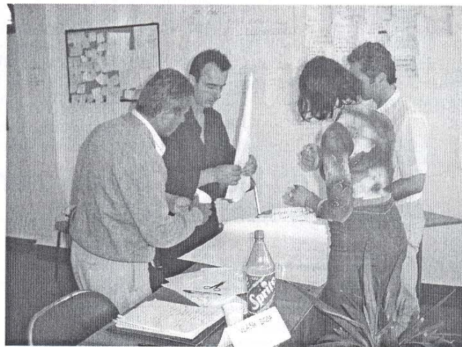
Leadership demands innovation

The power of organization is going to strengthen the influence on the elected people to solve problems. For these reasons these citizens need to improve their skills so they can be effective in leading communities and complete their mission.