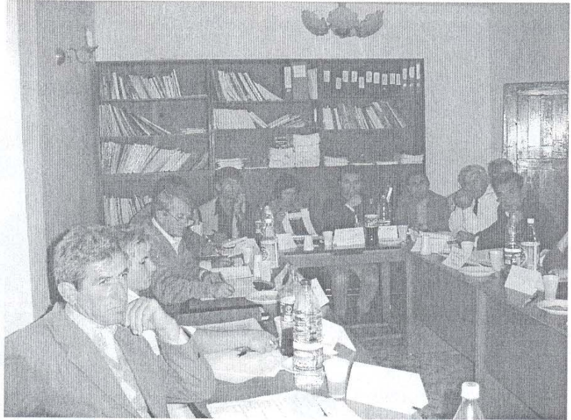
Engaged citizens consider team building

An ambitious vision to prepare committed citizens and communities, and identifying of people who are going to lead communities in these initiatives, these reasons were the resource which made Civic Forum think of the new project named "Engaged citizens". Commitment and independent work is going to improve their life in community. This project is focused in working with a "super-group", compounded by citizens that have been working with Civic Forum for a long time. These people are identified as motivated citizens in solving problems of community and who never missed meetings with Civic Forum. Also they took initiatives like meeting with elected people, writing letters to the editor, these related to the problems of community they are living.