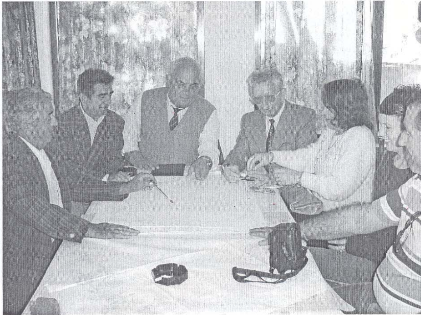
Citizens from Golem make strategic plans