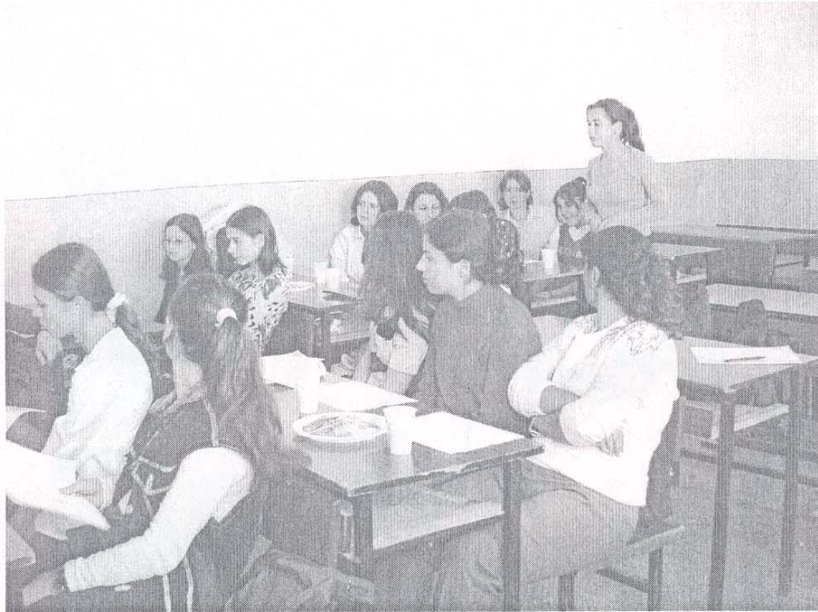
Students represent 20% of CF participants and are very active

This time "Interviews with Civic Forum" is made with the opinions of the students who participate in the Civic Forum program.