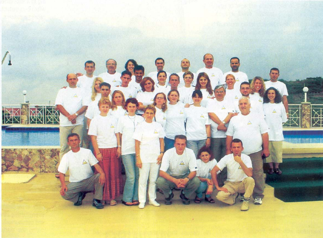
Kosovar and Albania field coordinators met in Tirana for the second joint retreat. (Story on page 2)

There are two things needed in life "JUSTICE – POWER" Sami Frashëri 1899