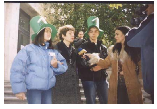
Ti Izbirash volunteers providing assistance to voters with disabilities

One of the elderly women who was accompanied by Ti Izbirash volunteers was impressed by their hats and exclaimed that the hosts of bTV morning show wear the same green cylinders. The volunteer action was covered by Varna local TV MSAT. When asked why they cast their vote, the volunteers answered that they are not indifferent to the problems of their city.