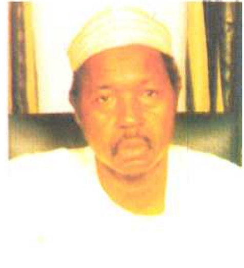
The Speaker House of Representatives Hon. Aminu Bello Masari