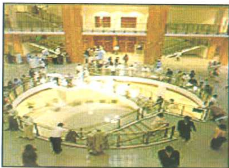
The National Assembly Complex Foyer

The public hearing was also attended by the Honorable Speaker of the House of Representatives as well as other members of the National Assembly. The Executive sponsors of the bill were in attendance so also agencies, Civil Society Organizations, the Revenue Mobilization, Allocation & Fiscal Commission, all 36 States of the federation and all state Accountant Generals were represented, Nigerian Bar Association, Institute of Chartered Accountants of Nigeria (ICAN), Nigeria Economic Society (NES), Private organizations and individuals, Nigeria Labor Congress (NLC), and National Association of Nigerian Students