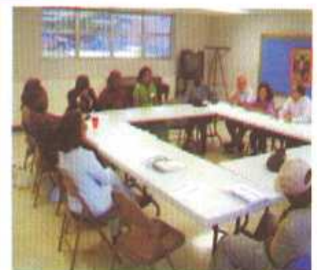
Cross Section of IRG Delegates