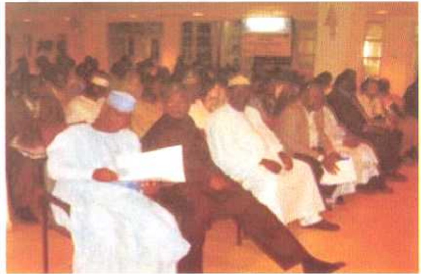
Cross Section of Guest at the Launch