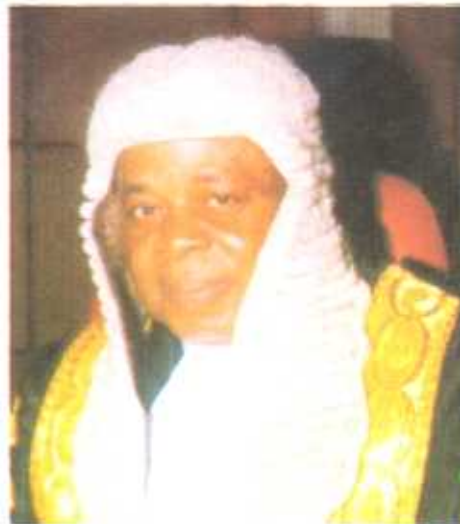
The Senate President Senator Ken Nnamani