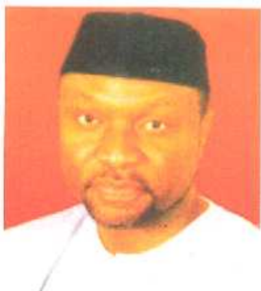
Senator Udoma Udo Udoma Chairman, Joint Committee Fiscal Responsibility Bill

In his opening remarks, the Senate President, Ken Nnamani stated that, "The National Assembly is determined to enact the best Fiscal Responsibility Law for Nigeria and this is derived from their commitment to provide credible and effective legislative mechanism to enable the executive perform its statutory responsibility.