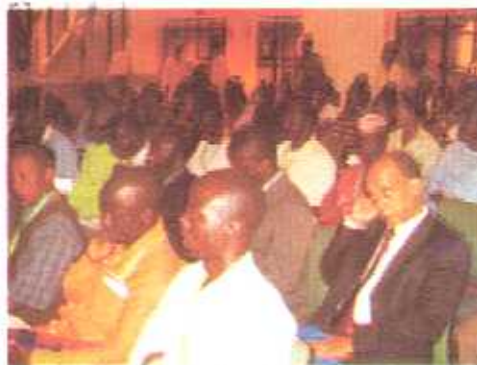
A cross section of guests at the Launch