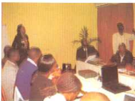
Participants at the CSO workshop in Lagos

The Dialogue Objectives were to develop the expertise on issues affecting pro-poor policy, develop strategies that will strengthen their capacity to fulfill their legislative and representative responsibilities with particular reference to MDGs and NEEDS. This was followed by another policy dialogue held from May 29 to June 1, 2006 at the City Lodge Hotel, Jos for select