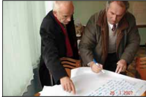
Participants in an NDI campaign planning seminar in Tropoja in January.

In preparation for the campaign period, NDI conducted more than 25 TRAINING SESSIONS FOR PARTY ACTIVISTS from Albania's major political parties. NDI trained more than 500 candidates, campaign managers and party activists on media communication, campaign strategies, and public speaking skills. In addition, 13 of 67 participants in NDI's Political Skills and Leadership Academy competed in the local elections as candidates for either city council or mayor, with nine winning their contest.