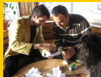
Following the training series, advanced participants engaged in a ToT seminar to build their capacity to assist others in developing similar skills.