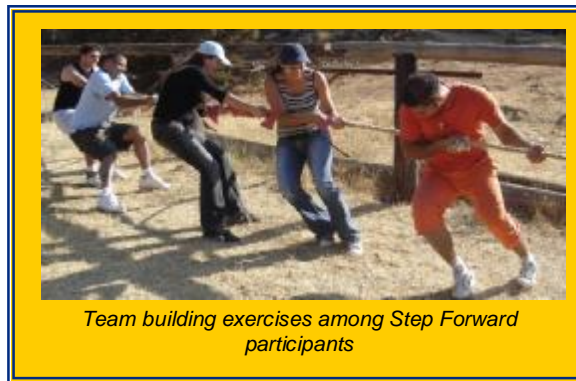
Team building exercises among Step Forward participants

resumed training in September with a weekend retreat outside of Beirut aimed at rebuilding confidence between participants through team-building exercises and sessions on post-war reconciliation.