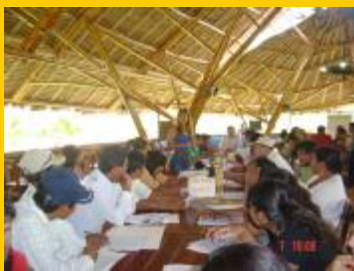
Santa Cruz citizens take part in thematic working groups.

The community dialogue series offered participants objective information regarding the 2005 and 2006 elections and the constituent assembly processes. Following an information sharing workshop, NDI