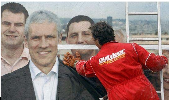
A Democratic Party poster goes up in Belgrade. The party seeks to capitalize on President Tadic's popularity.

The DS-led coalition, which includes G17 Plus, the Sandzak Democratic Party, Serbian Renewal Movement and League of Social Democrats of Vojvodina, has focused its campaign on the benefits of EU membership and protecting Serbia's sovereignty, asserting that the most effective way to regain Kosovo is by working as an EU member from the inside with the nine member states that have not recognized Kosovo to date.