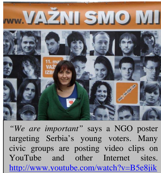
"We are important" says a NGO poster targeting Serbia's young voters. Many civic groups are posting video clips on YouTube and other Internet sites. http://www.youtube.com/watch?v=B5e8jik

The campaign has been increasingly heated and not only in rhetoric. Nationalist parties at one point pledged to put President Tadic on trial for the SAA agreement. Nationalist groups have physically assaulted pro-Europe civic activists as well as independent journalists, branding them "traitors" and threatening to prosecute them. One Radical official has called for a fight against media and NGOs that espouse a pro-Europe agenda, suggesting a need to foster "patriotic and national spirit" in the young generation. Undaunted, civic groups are organizing to turn out the vote, particularly among young voters. Among the many efforts: