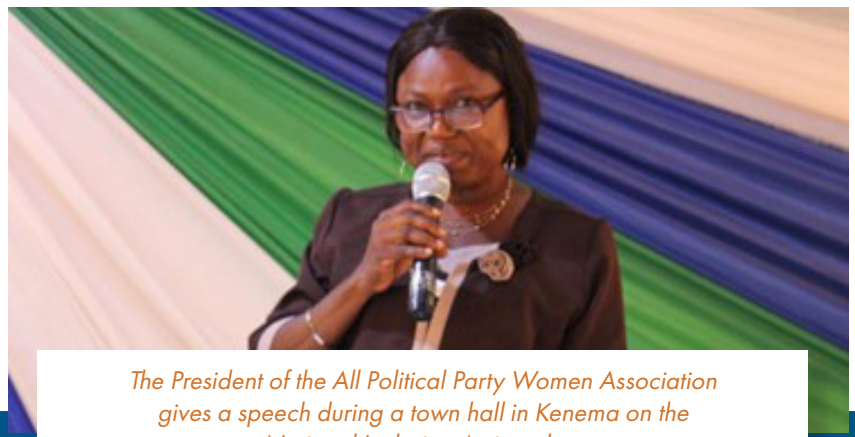
The President of the All Political Party Women Association gives a speech during a town hall in Kenema on the National Inclusion Action plan.